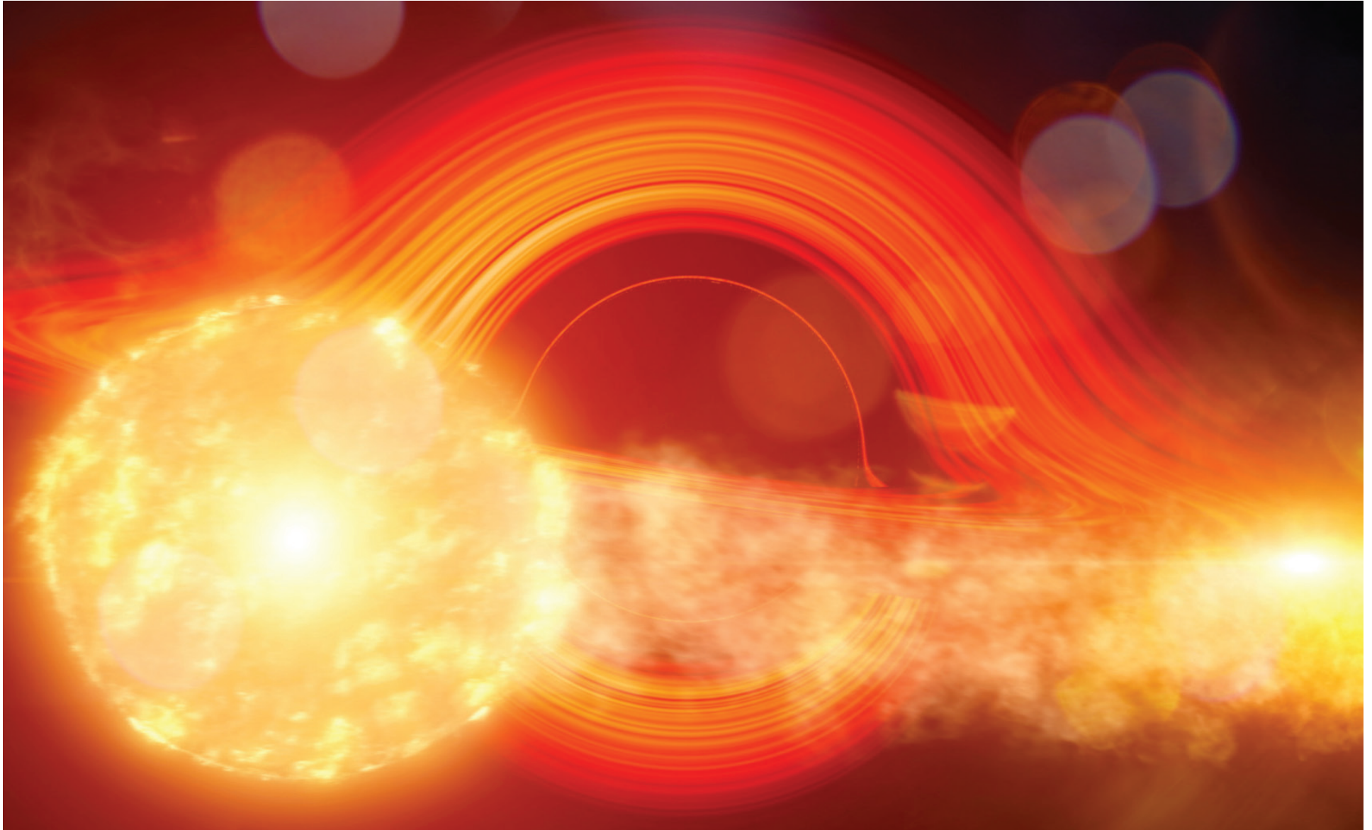
ASASSN 14o: Artists impression of the star being ripped apart by its supermassive black hole. Credit: NASA's Goddard Space Flight Center/Chris Smith (USRA/GESTAR)