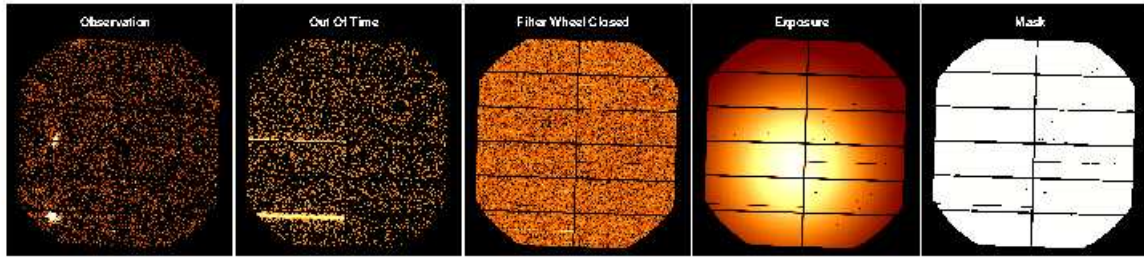
Figure 1: Output images.